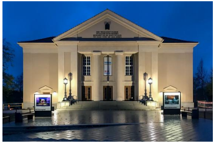
LED Floodlight EcoMax G2 30W/50W/70W