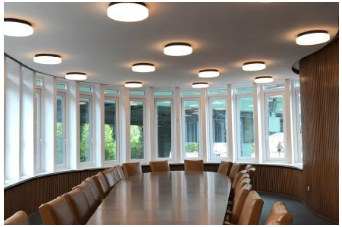
LED Module Clio G2